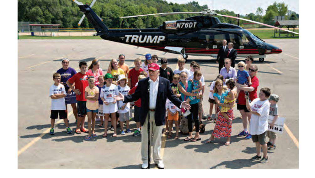
In the 2016 presidential campaign, the popularity of nonestablishment, "outsider" candidates, such as businessman and reality-TV star Donald Trump, pointed to Americans' continued frustration with and distrust of the federal government.

Several factors contributed to the decline in trust. Revelations about the faulty information that led up to the war in Iraq and ongoing concern about the war had increased Americans' distrust of government. In March 2007, 54 percent of those surveyed believed that the Bush administration had deliberately misled the American public about whether Iraq had weapons of mass destruction.